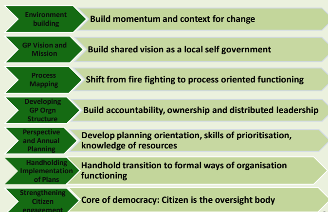
Illustration of GPOD implementation modules