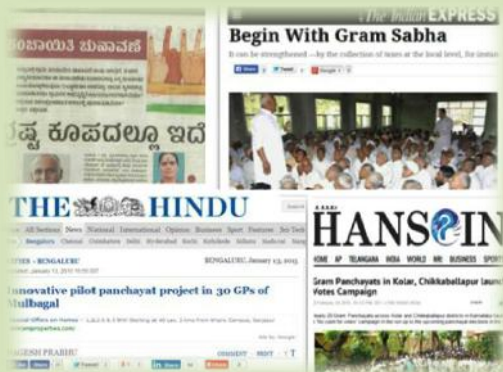
Illustration of Media Articles on project for strengthening of Gram Panchayat Organisations

http://www.thehindu.com/news/national/karnataka/gp-members-to-launch-no-cash-for-votes-during-polls/article6929182.ece